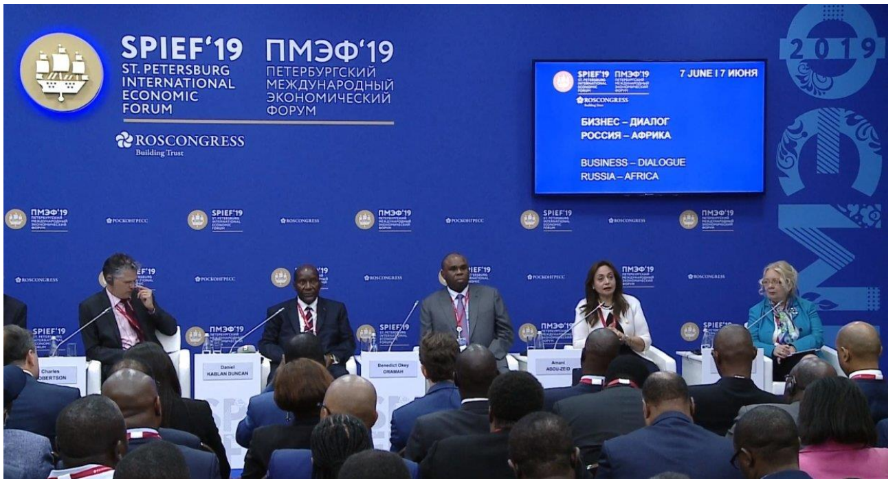
Representatives of Russia and African countries discussed the potential areas of cooperation during the side event “Business dialogue - Russia – Africa”, XXIII Saint-Petersburg International economic forum