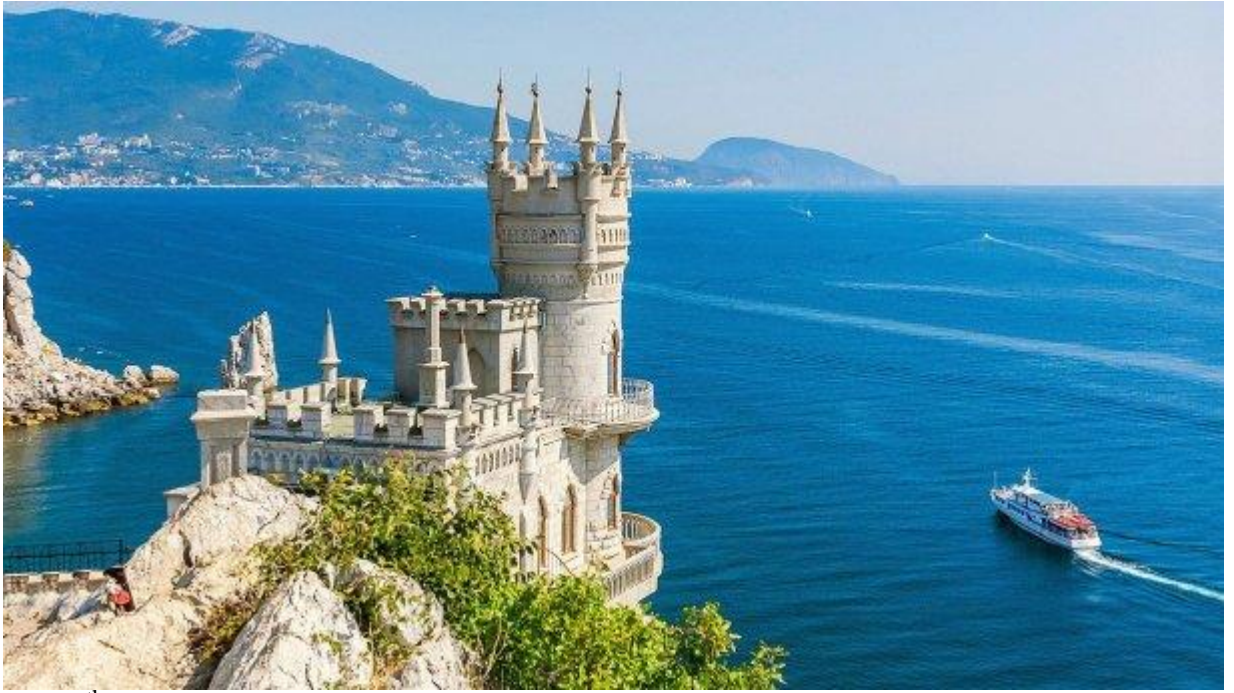
18 th of March, 2019 is the fifth anniversary of the Crimea's return to Russia