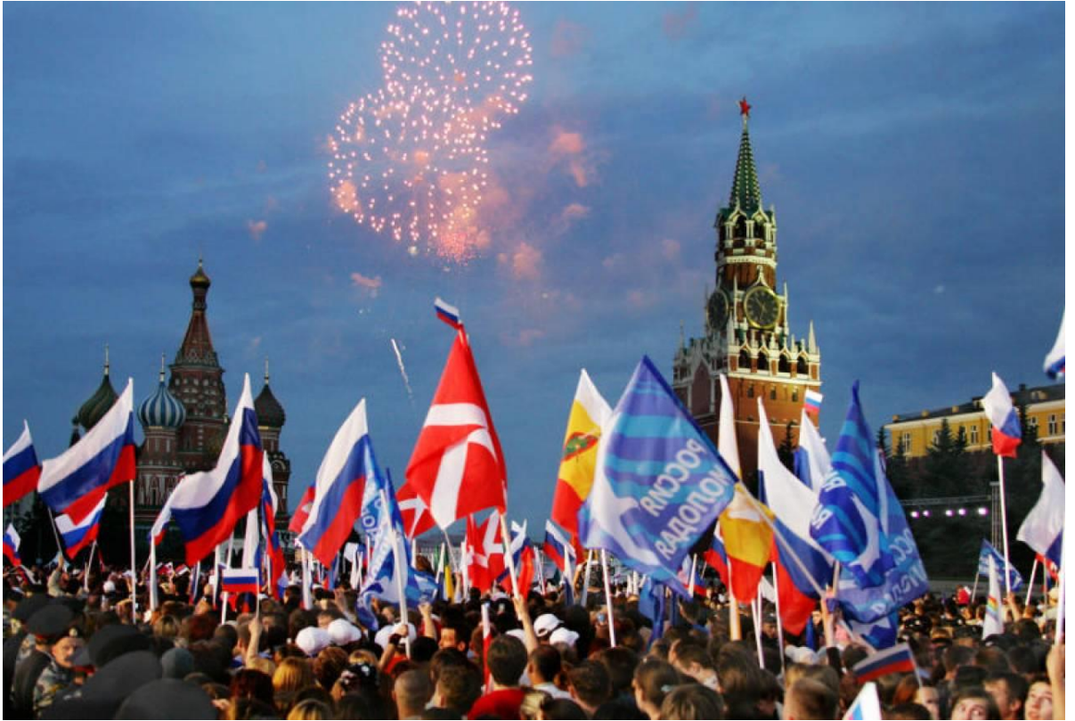
Festive celebrations on the occasion of Russia Day on the Red Square 12 th of June, 2018