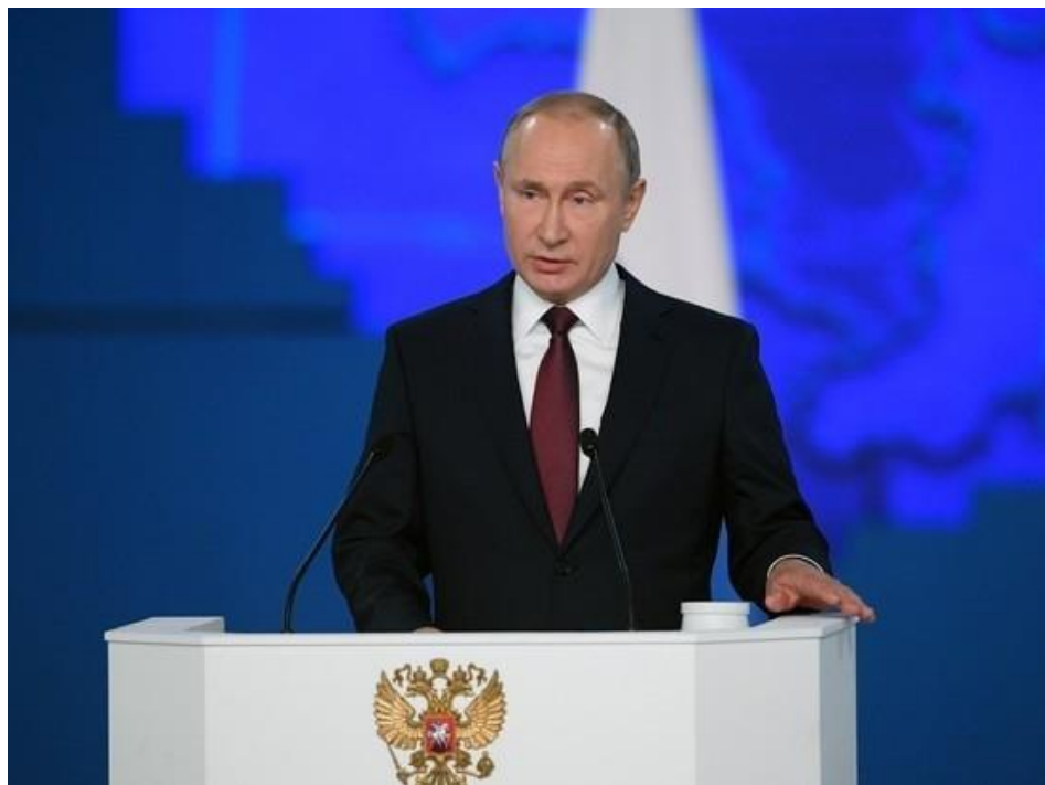
President's Putin address to the Federation Council of the Federal Assembly of the Russian Federation