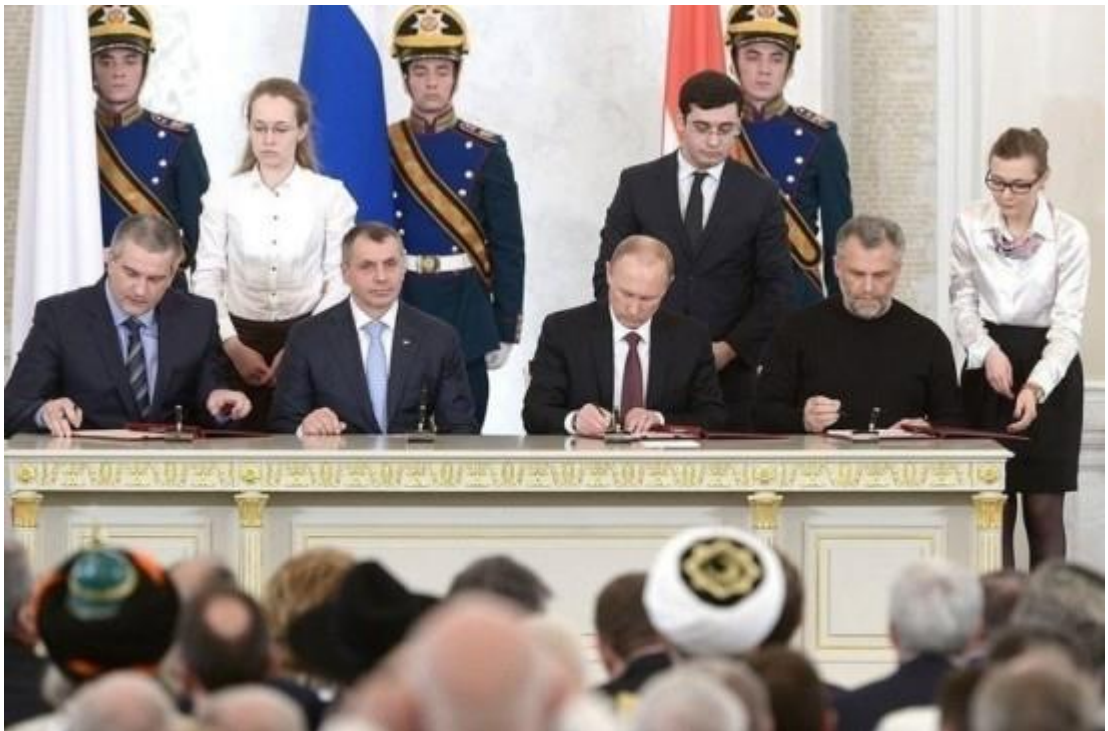
Signature of the Treaty, initiating the procedure of the accession of Crimea to the Russian Federation